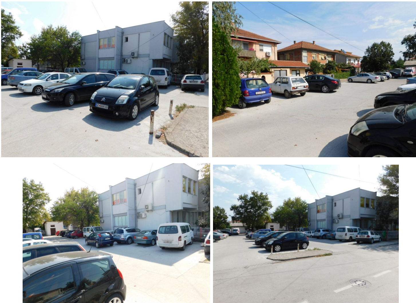
Figure 2 Pictures of the location where the mobile COVID 19 hospital will be installed